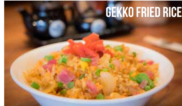
GEKKO FRIED RICE