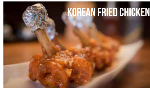
KOREAN FRIED CHICKEN